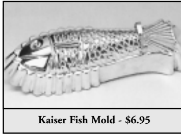
Kaiser Fish Mold - $6.95

If you're planning a dinner party in the near future, consider serving a smoked salmon mousse. It is always a popular treat! For a festive presentation, try using a fish mold. You are sure to receive oohs and aahs when you turn your fish-shaped mousse out onto a pretty platter. Kitchen Window carries a 10.5 inch fish mold from Kaiser. It is made from tinned steel and it has an attached handle for easy unmolding.