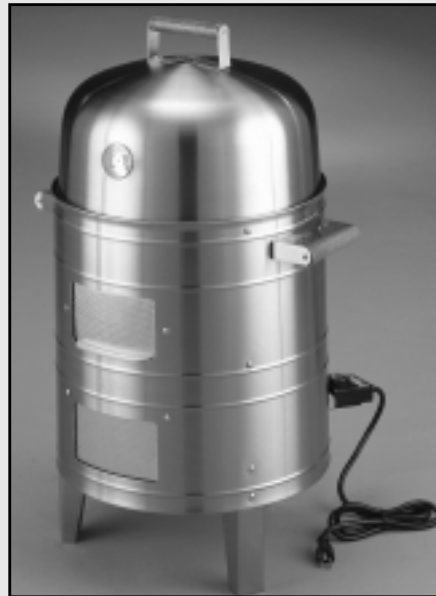
Meco Stainless Steel Electric Water Smoker

With both hot smoking methods, the process should be closely monitored. While cooking on a hot smoker is a much cooler and slower process than cooking on a grill, it should still be considered cooking. It's the basic stage in barbecue, after all, and can take over 24 hours using the right equipment. When you determine that the food is at the right internal Temperature, right Texture and delivers a pleasing Taste, pull it out of the smoker. If you keep cooking, you're likely to produce something like..... JERKY! And that could be a Great Thing. Instead of "Bac-O-Bits" to garnish a spinach salad, you've now got genuine Copper River King Salmon, Natural Hardwood Charcoal smoked, "Krunch-E-Bites".