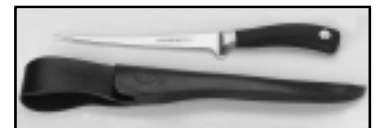
Wüsthof 7" Fillet Knife with Sheath Reg. $100.00 Sale $69.99

The ideal knife for lake fish. Transportable with its leather sheath, the knife features a flexible forged blade that is razor sharp and easily manipulated through the fish. A micro-pebble ergonomic handle ensures a solid grip even with wet hands.