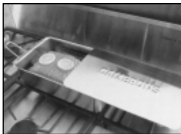
Cameron Stove-top Smokers 15" X 11" - $49.95 11" X 7" - $39.95

Indoor stove-top smokers are a great way to achieve a nice smokey flavor without too much smoke. Cameron makes two sizes of these wonderful gadgets. The larger is 15 X 11 inches and the smaller is 11 X 7 inches.