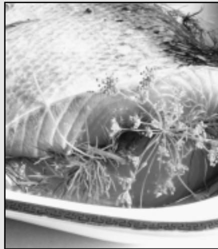
Gravlaks as Pictured in Kitchen of Light, Artisan, 2003

If you love salmon, this is the time of year to visit your favorite fish market. Be sure to ask for the Copper River salmon for a special treat. You'll find Chinook salmon from mid May to early June, sockeye salmon from mid May to early August and Coho salmon from mid August to late September. Don't worry too much if you miss the season; The Wedge Coop stocks their freezers this time of year to quell any untimely cravings!