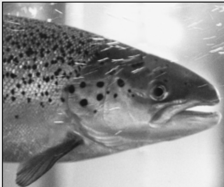
Salmon as Pictured in Kitchen of Light, Artisan, 2003

During the migration back to fresh water, the chemical and physical makeup of the salmon changes again, this