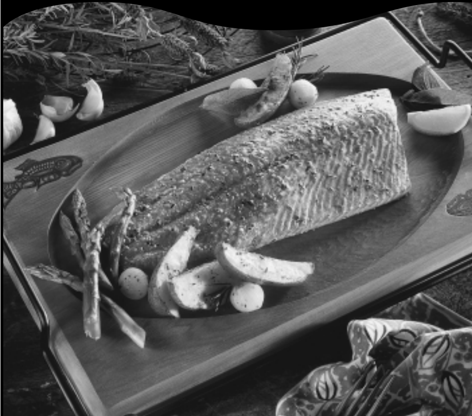
Cedar Planked Salmon using a Chinook Cedar Plank