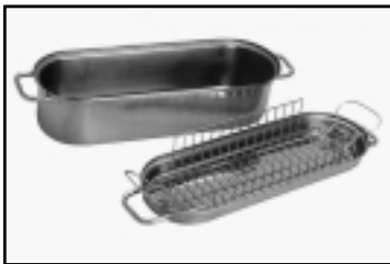
Fish Poachers 18" - $49.95 24" - $69.95

Poached fish is a healthy and tasty treat. The only trick to poaching is to find a pan that is long enough and a way to transfer the cooked fish without it falling apart. Fish poachers are the answer. They not only